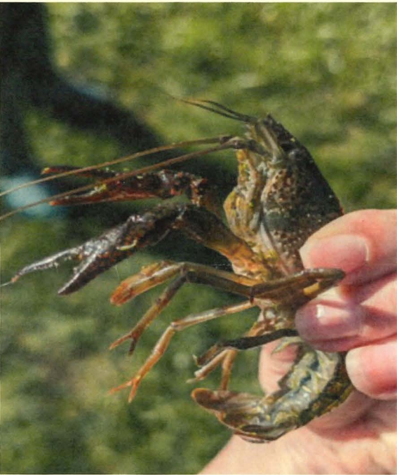
There are eight native species of crayfish in Michigan, but one of the identifying characters of invasive RSC is their red coloration and red bumps on their claws.